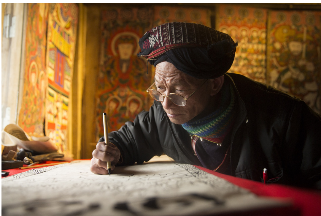
Figure 2.1: image1 of ch2