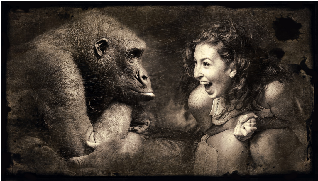
Figure 1.2: image3